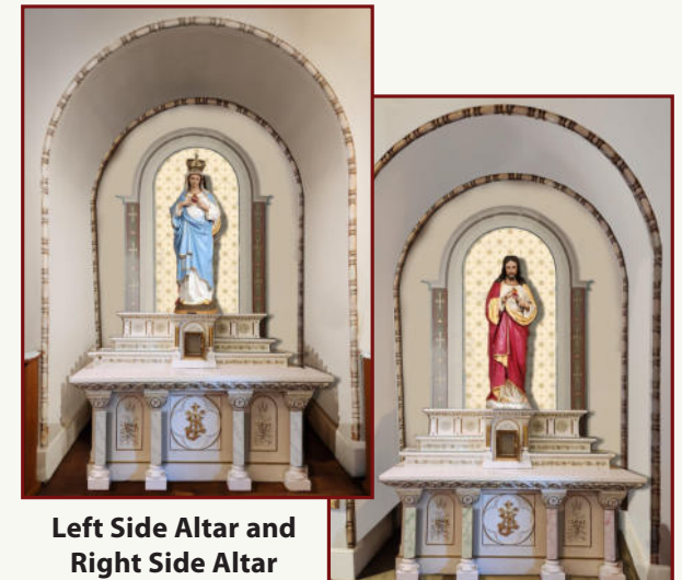
Left Side Altar and Right Side Altar

CAPITAL CAMPAIGN MINIMUM GOAL - $300,000