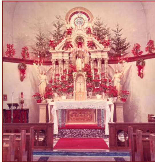
Historic Image of St. Francis Xavier Altar