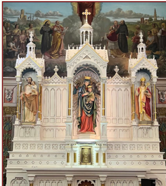
Our Lady of Perpetual Help Altar