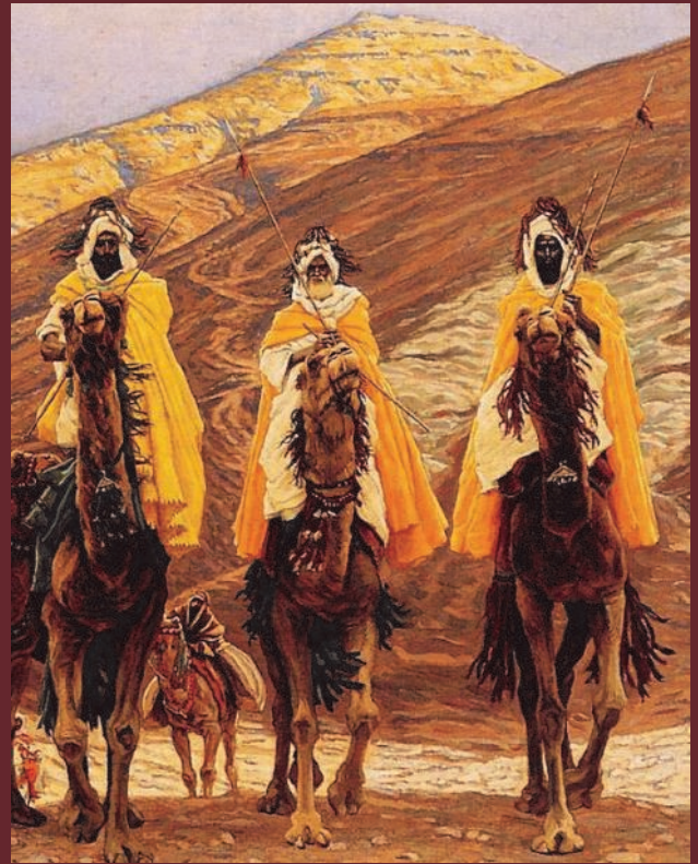
Journey of the Magi James Tissot (1894)

When Jesus was born in Bethlehem of Judea, in the days of King Herod, behold, magi from the east arrived in Jerusalem, saying, "Where is the newborn king of the Jews? We saw his star at its rising and have come to do him homage." (Mt 2:1-2)