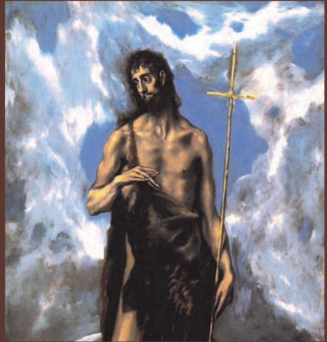
Saint John the Baptist El Greco (1600)

Behold, I am sending my messenger ahead of you; he will prepare your way. A voice of one crying out in the desert: "Prepare the way of the Lord, make straight his paths" (Mk 1:2b-3)