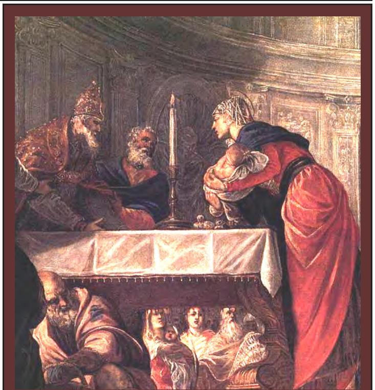
The Presentation of Christ in the Temple Tintoretto (1555)