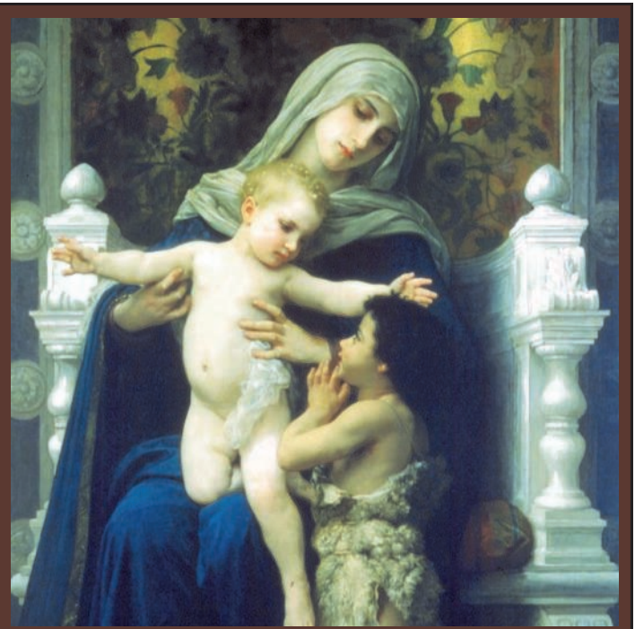
The Virgin, Jesus & St. John the Baptist William Bouguereau (1881)

A man named John was sent from God. He came for testimony, to testify to the light, so that all might believe through him. He was not the light, but came to testify to the light. (Jn 1:6-8)