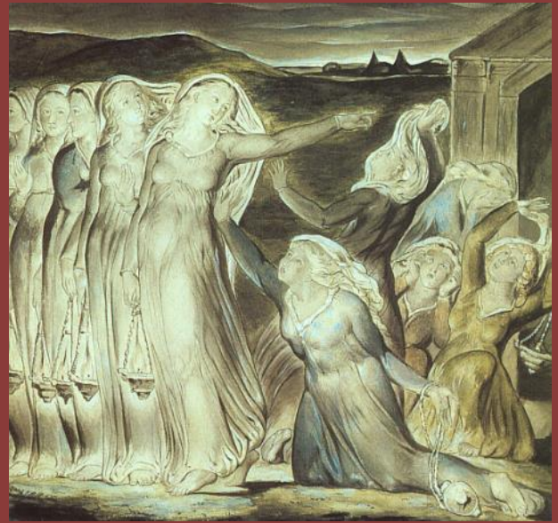
The Parable of the Wise and Foolish Virgins William Blake (1822)

"Then all those virgins got up and trimmed their lamps. The foolish ones said to the wise, 'Give us some of your oil, for our lamps are going out.' But the wise ones replied, 'No, for there may not be enough for us and you. Go instead to the merchants and buy some for yourselves.'" (Mt 25:7-9)