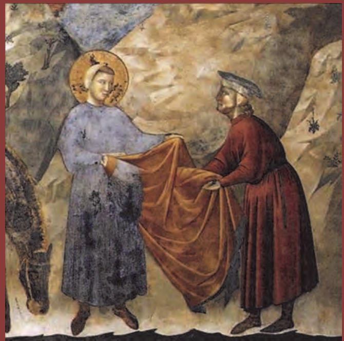
St. Francis Giving His Mantle to a Poor Man Giotto (1299)

"Then the king will say to those on his right, 'Come, you who are blessed by my Father. Inherit the kingdom prepared for you from the foundation of the world. For I was hungry and you gave me food, I was thirsty and you gave me drink, a stranger and you welcomed me, naked and you clothed me, ill and you cared for me, in prison and you visited me.'" (Mt 25:34-36)