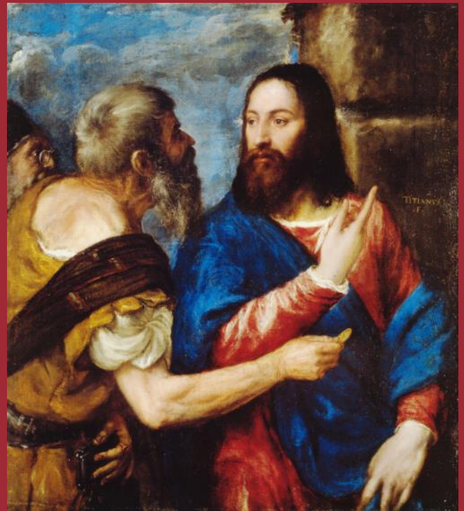
The Tribute Money Titian (1568)