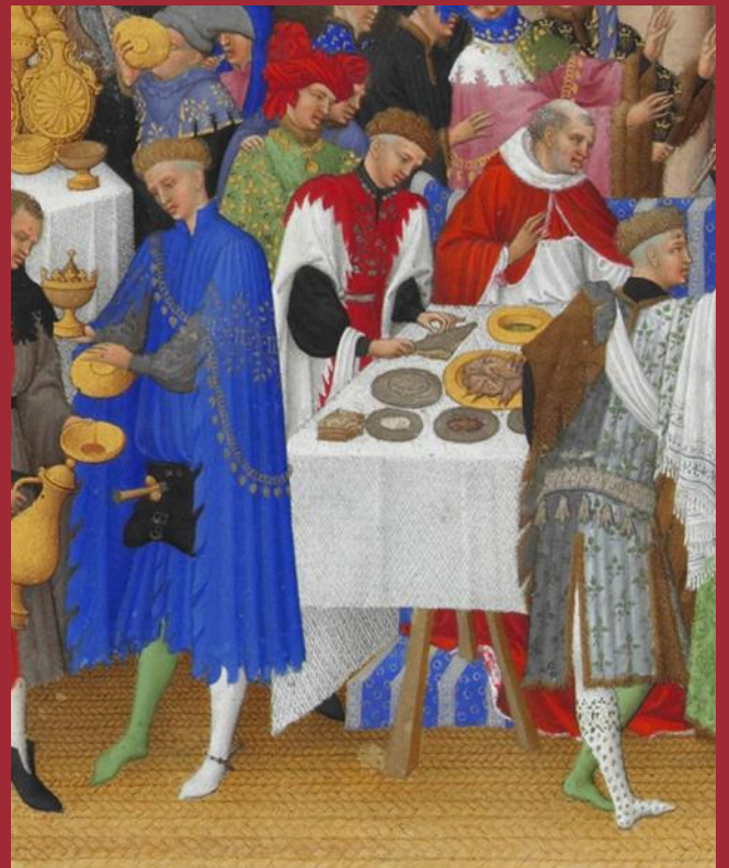
January: Banquet Scene Limbourg Brothers (14 th Century)

"The feast is ready, but those who were invited were not worthy to come. Go out, therefore, into the main roads and invite to the feast whomever you find.' The servants went out into the streets and gathered all they found, bad and good alike, and the hall was filled with guests." - (Mt 22:8b-10)