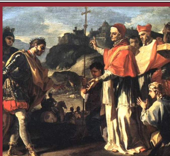
The Meeting of Pope Leo and Attila Francesco Solimena (17 th - 18 th Centuries)

"Blessed are the poor in spirit, for theirs is the Kingdom of heaven. Blessed are the peacemakers, for they will be called children of God." (Mt 5:3, 9)