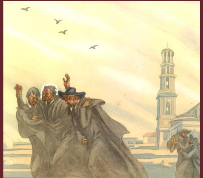
Ignatius & Companions Set Off to Save Souls Carlos Saenz de Tejada (20 th Century)

September 6 th - SFX School Collection September 13 th - Building Fund