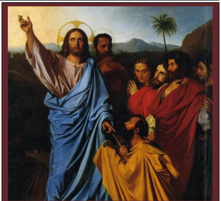
Jesus Returning the Keys to St. Peter Jean Auguste Ingres (1820)

August 30 th - Diocesan Assessment September 6 th - SFX School Collection