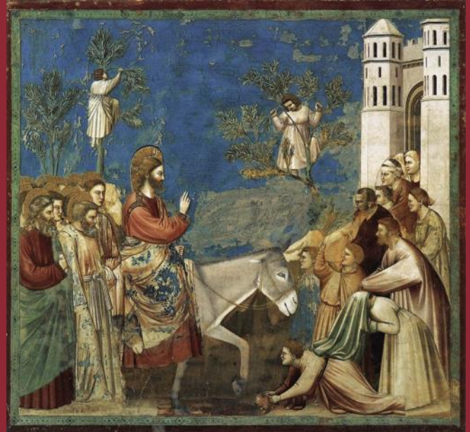
The Entry Into Jerusalem Giotto (1305)

July 12 th - Building Fund July 26 th - Diocesan Assessment