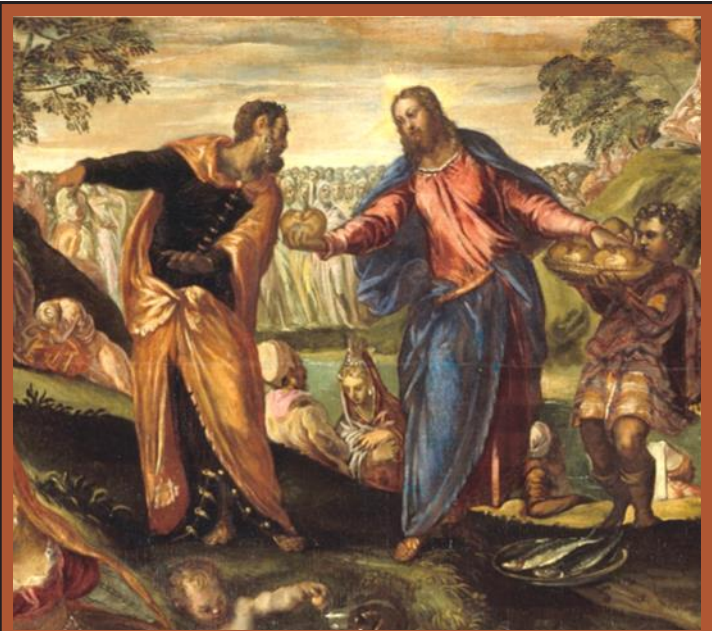
The Miracle of the Loaves and Fishes (detail)