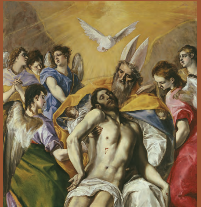
The Holy Trinity El Greco(1778)

June 7 th - Ecclesiastical Students June 14 th - Parish Building Fund