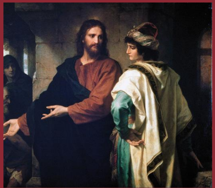
Christ and the Rich Young Ruler Heinrich Hoffman (1889)