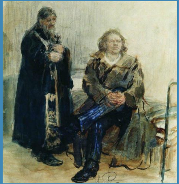
Refusal of Confession Ilya Repin (19 th Century)