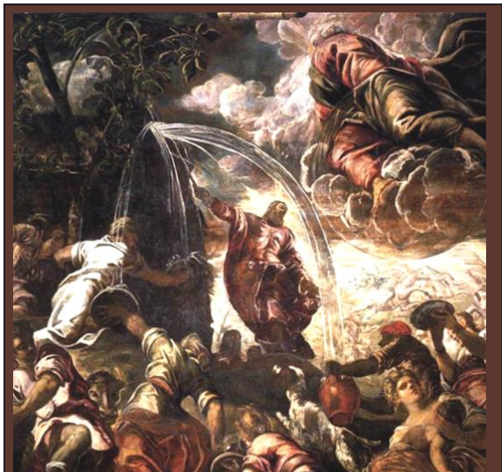
Moses Drawing Water from the Rock Tintoretto (1577)