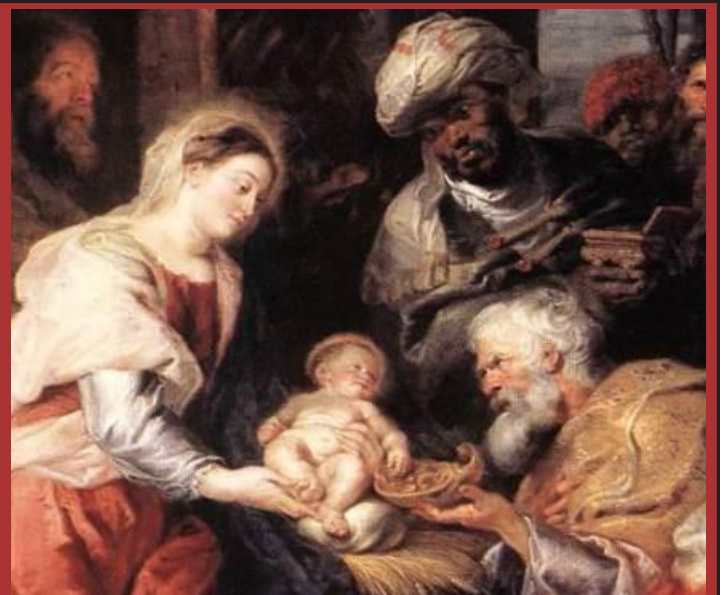
Adoration of the Magi Peter Paul Rubens (1629)