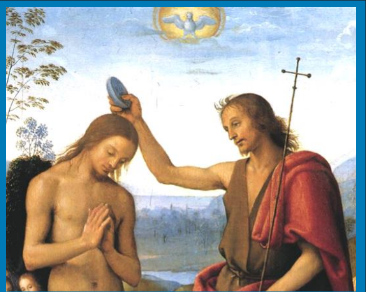
Baptism of Christ Pietro Perugino (1550)

No class for all levels on Sunday January 19, 2020 in observance of Martin Luther King.